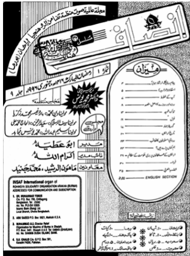
Publication of RSO's Urdu mouthpiece 'Insaaf' is patronized by Islami Bank of Bangladesh. Each issue contains bank account number with Islami Bank

The Bangladeshi press has published scores of reports on the link between IBBL board and Jamat-e-Islami on countless occasions. Here I would like to quote parts of a report published in a journal of Jamat-e-Islami, Pakistan. A delegation of Jamat-e-Islami, Pakistan came to visit Bangladesh in January 2004 at the invitation of Jamat-e-Islami, Bangladesh. Besides joining the annual convention of Shibir (Jamat's student wing) and meeting with top Jamat leaders including notorious war criminals Golam Azam and Nizami, the delegation visited a number of commercial concerns of Jamat-e-Islami, Bangladesh. Upon return to